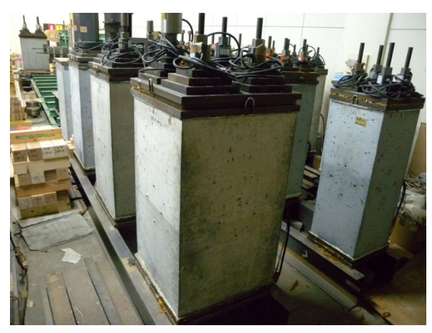
Creep Compression Test of High Strength Concrete Columns