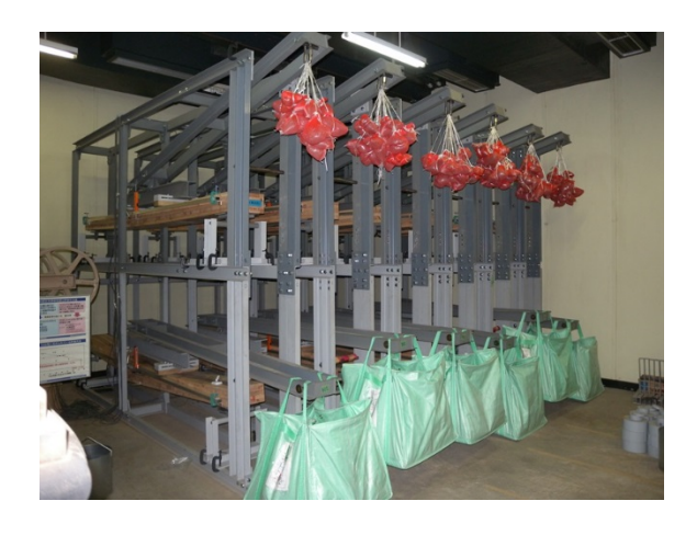
Creep Bending Test of CLT Components (Up: Creep Deformation, Lo: Creep Failure)

Creep test room of components is used for the creep test of real size building beams and columns. Creep bending tests using timber beams and creep compression tests using concrete columns are conducted in the room.