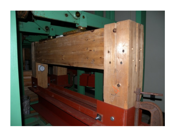
Creep Test of Timber Joints