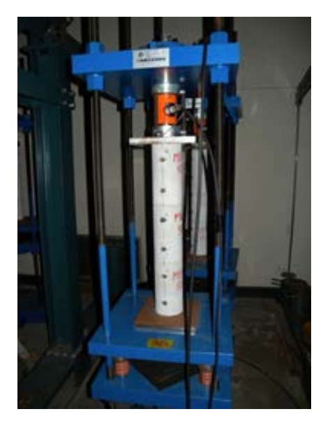
Creep Compression Test of Cylindrical Concrete Specimens

Creep test room of materials is used for the creep test using small specimens of building materials. Long term creep test are applied for samples removed from buildings.