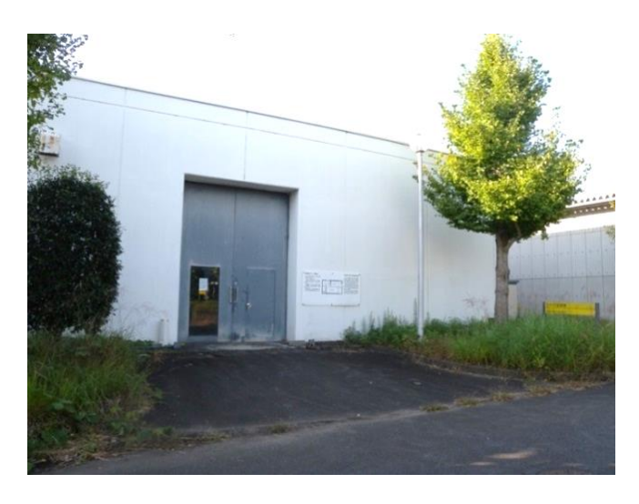
Exterior of Creep Test Laboratory

Purpose of creep test laboratory is to reproduce these creep phenomena of the materials. Creep phenomena are affected by temperature for long periods. Preventing temperature effect for the creep of materials, creep test laboratory has constant temperature and humidity- controlled test rooms. Temperatures and humidity of the test rooms are controlled in 20 degree Celsius and 65 present RH.