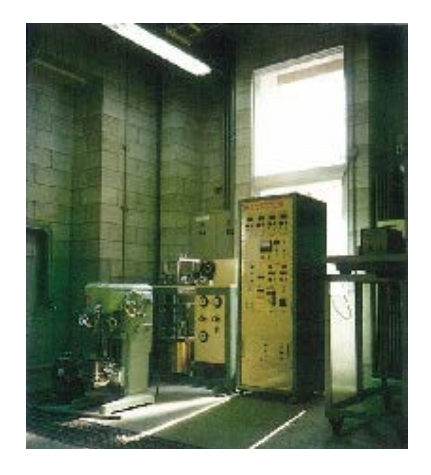
Shearing Test Apparatus