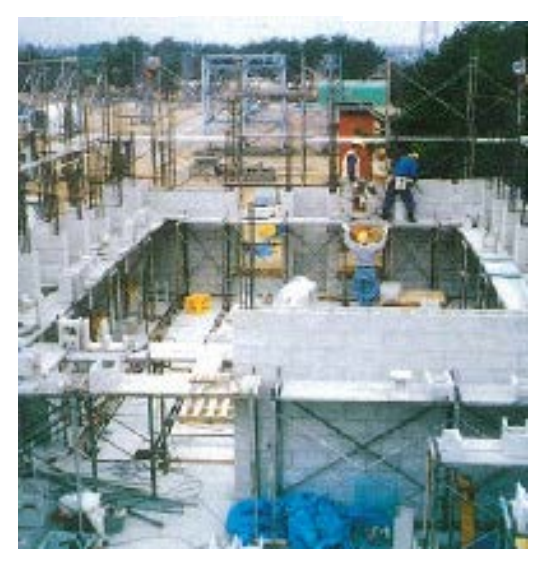
The Construction site of RM building (Building Systems Laboratory)