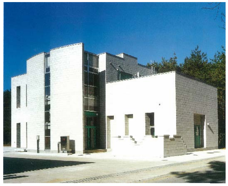
Building Systems Laboratory

In terms of building and construction (building systems) as well as material development, additionally based on status of usage, the experiments and studies on composition or combination with other materials are conducted.