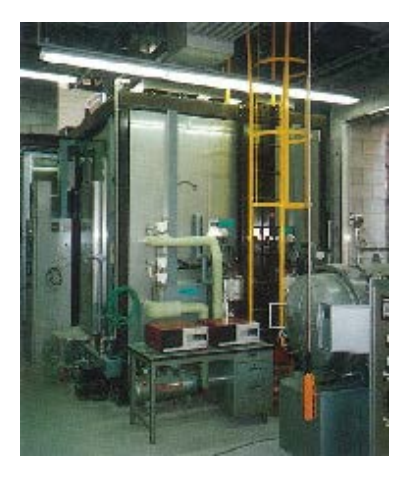
Durability Test Apparatus