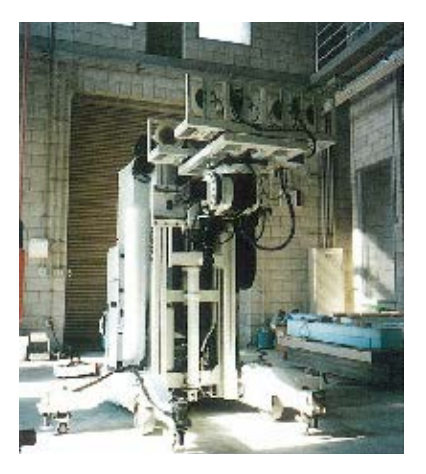
Automatically Construction Robot